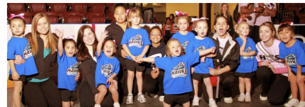
Tiny Team with Coaches & CITs

If you have a birthday coming up, come celebrate it with us!! You'll learn a short routine, to show off to your family at the end of your party.